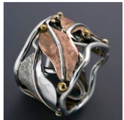
MINKY GRANT, ring, sterling silver, 18kt & rose gold