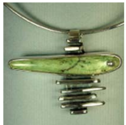
MARET KALMAR, neckpiece, jade, sterling silver