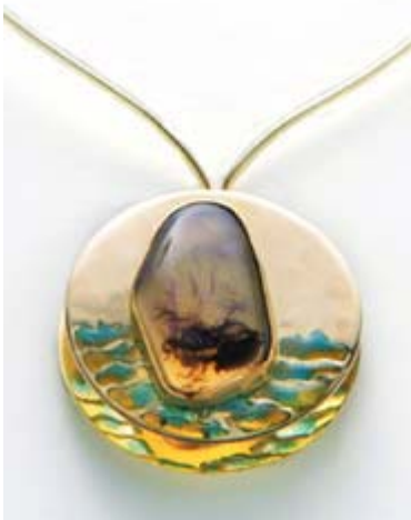
neckpiece, 'sea change' jelly opal, 18 kt gold, plique-a-jour enamel