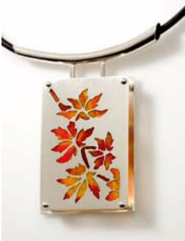
plique-a-jour, sterling silver neckpiece