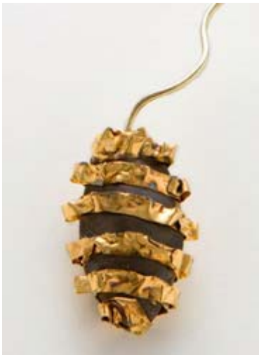
neckpiece 'beware shark egg' shakudo, gold