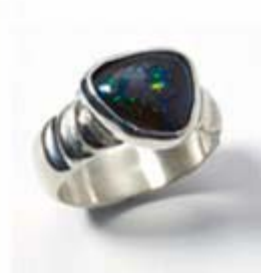
2. server 'seza' sterling silver 3. sterling silver, opal ring