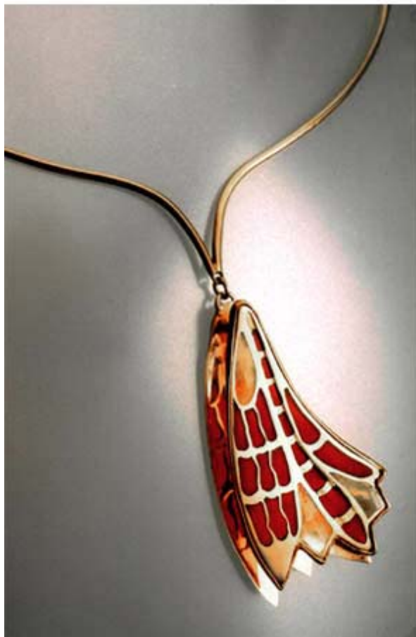
1. plique-a-jour gold neckpiece