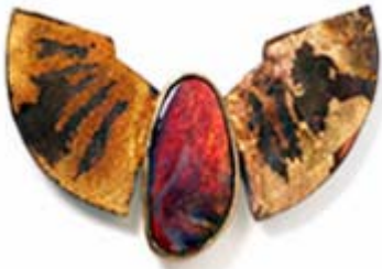
brooch 'moth' shakudo, opal, sterling silver