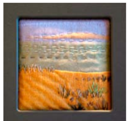
CAROLYN CABENA, 'sandscape' series, silk, linen, handstitched over wool filling