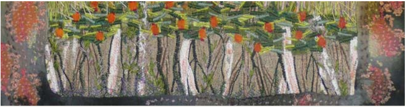
from 'Voyages of the Imagination' ATASDA: Jane Bodnaruk, detail, 'Banksia'