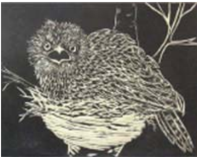
Carole Siu , Tawny Frogmouth , Linocut, Chine Collé