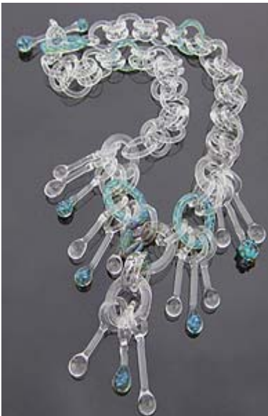
Natalie Monkivitch, Blue Frog Drops