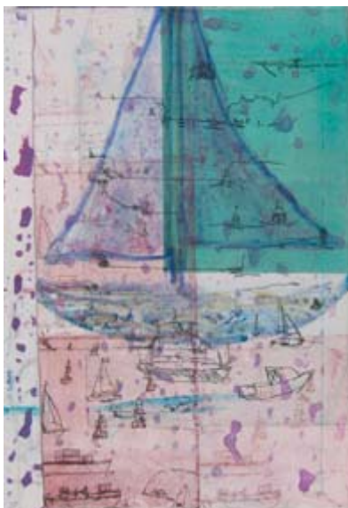
Judy Bourke , Souler Sailor 1, Intaglio Polymer/Monotype