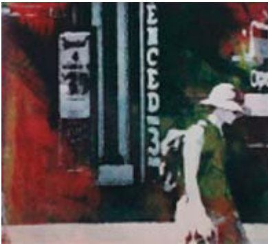
Julia Sample , City Street Scape II , Intaglio Polymer