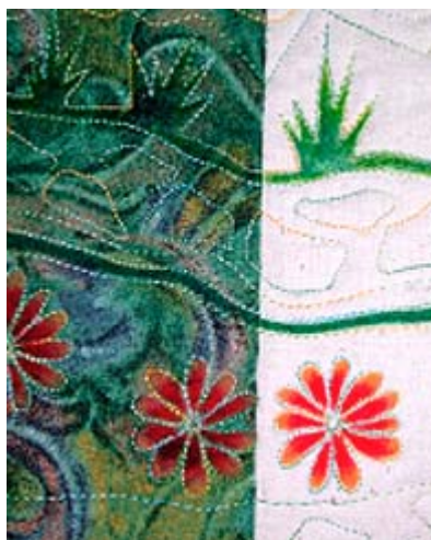
Lois Parrish-Evans, The Valley, detail