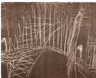
Rebecca Baird , The Bridge, Intaglio Polymer