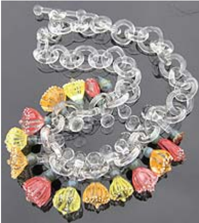
Natalie Monkivitch, Blossom Dreams

manipulated using heat, gravity and/or tools. In the case of beads the glass is wound around a mandrel which is removed after annealing, leaving a hole through the bead.